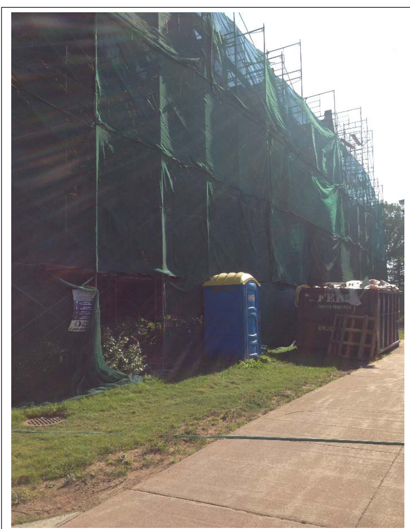
The New Transparency